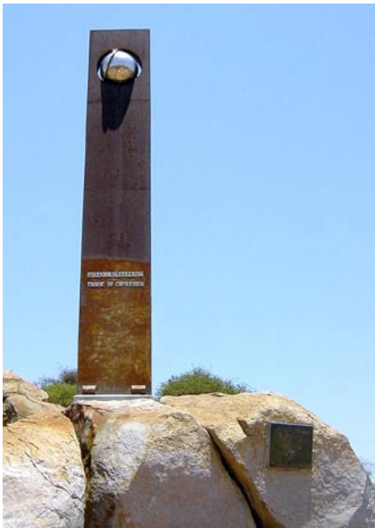
Monument marking the tropic of Capricorn outside Polokwane, Limpopo province.

The name 'Tropic of Capricornus' originates from the fact that when first ob-