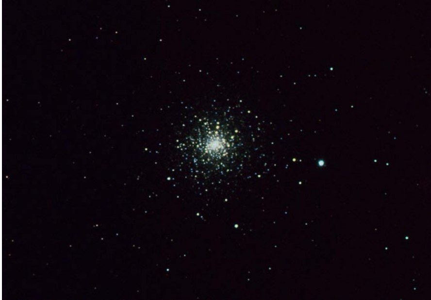
M 30 Globular Cluster, or NGC 7099, is a comet-like cluster, that moves the opposite direction to the rotation of the galaxy, probably as the result of an intergalactic gravitational encounter. Dale Liebenberg

slightly longer, giving the impression of a pair of firefly antennae. The southeastern part of the globular is broken down in starlight and in a way cut off by a short string of four stars. Also to be seen is a double star towards the southern part. Messier 30 is a large globular cluster that can be easily spotted with binoculars and measures nearly 90 light years in diameter. It is a very special object – one to remember long after observed it.