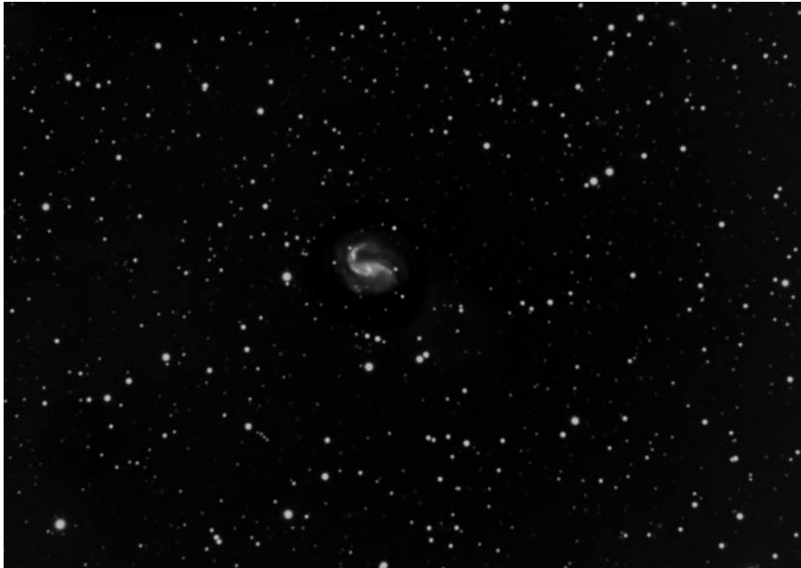
NGC 6907 Its misty glow represents a miniature Large Magellanic Cloud. Dale Liebenberg

double star. In fact, four companions are listed. Double star director Dave Blane indicate that Alpha Capricorni is an optical double star with components \alpha^1 Cap and \alpha^2 Cap having magnitudes 4.3 and 3.6 respectively. They have a separation of 381" at a position angle of 292^\circ . \alpha^1 is a G type super-giant and \alpha^2 is a giant star of the same spectral class. Each component is in turn a multiple star, with \alpha^1 having a magnitude 9.6 companion with separation of 46.9" at a position angle of 222^\circ , which is unrelated, while \alpha^2 has a magnitude 10.5 companion with separation 153" at a PA of 160^\circ .