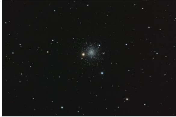
NGC 5634 sheltering in Virgo’s feet. Dale Liebenberg.

Dress up snugly and warmly, make yourself a flask of coffee and sit down with the lady Virgo to seek out those faint, misty “clouds” that are, in fact – almost unbelievably – entire galaxies. ☆