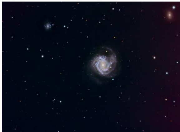
M61-NGC4303 barred galaxy. Dale Liebenberg.

The planet Neptune was seen in Virgo about 20' east of the magnitude 6 star HD 105374, and 2 degrees west of eta Virgini,