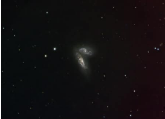
NGC 4567-8, the Siamese Twins.

nucleus. NGC 4567, the slightly smaller galaxy in comparison, has a dense bright pin-point nucleus. The interacting spiral pair are gently joined at their north-eastern tips. Barely 10' towards the north is another spiral companion member, NGC 4564, in an east-west direction.